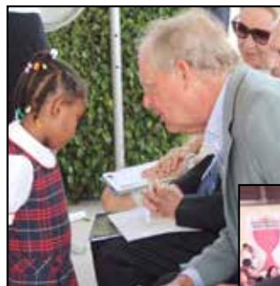
William B. Finneran Montessori Academy Dedication 2011